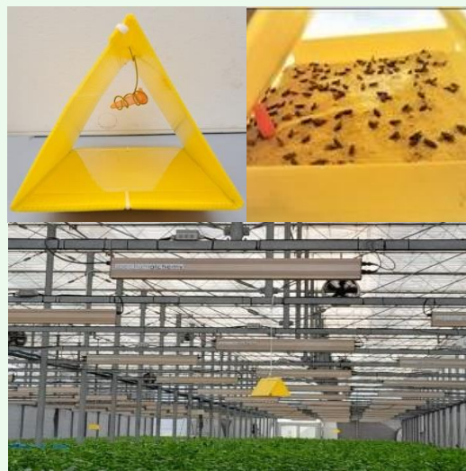
DBM Pheromone Trap

The lure can either be prepared in-house following the procedure detailed below or purchased from local vendors.