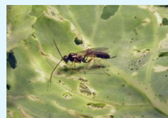
Diadegma semiclausum , an effective biocontrol agent on DBM