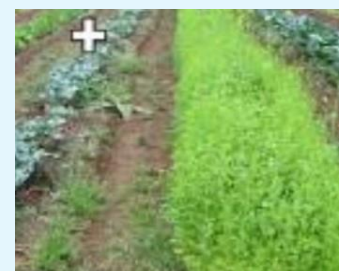
Mustard as a trap crop