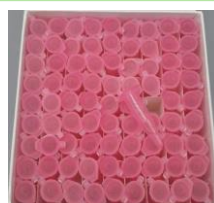
DBM pheromone lure in microcentrifuge tubes