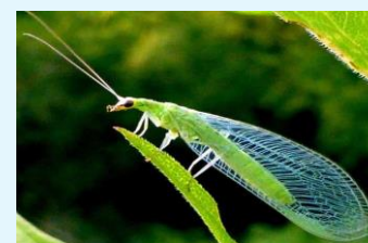
Lacewings, a predatory insect on DBM

NOTE: Licensed farms must engage SFA-certified pesticide farm operators if they want to apply agricultural pesticides. The course and test are conducted by ITE College East. For course details, you may contact ITE (Tel: 1800 222211 / 65902211)